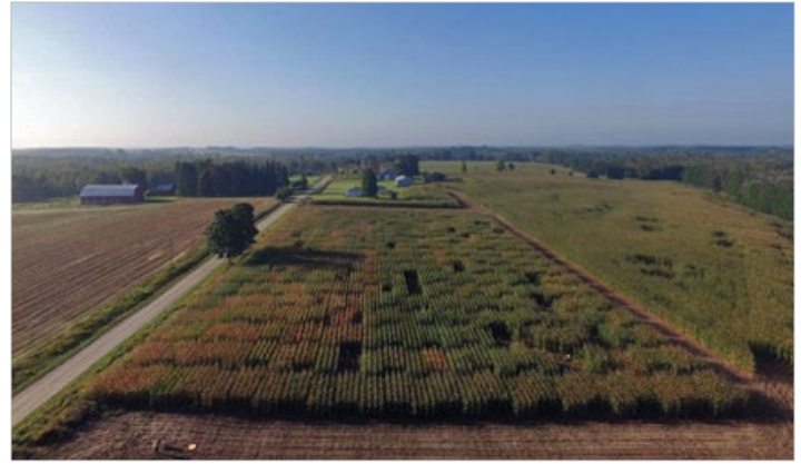
Black bear feeding indicates variety preference in this corn variety research trial.

For a temporary, easy to install and move system, use three polytape strands charged with