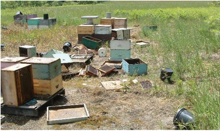
Damage to an apiary by black bear.