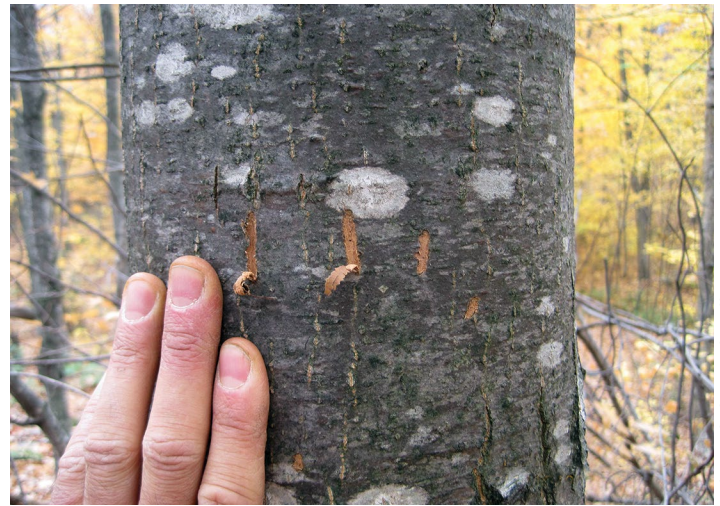
Rob Routledge, Sault College, Bugwood.org

Bears are a very important game species to state wildlife agencies. It is fair to expect that agencies will offer assistance in some measure when bears are causing damage. It is also common for wildlife agencies to ask that producers exhaust non-lethal techniques before more aggressive measures are tried to address bear damage.